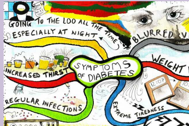
An example of a mind map using images