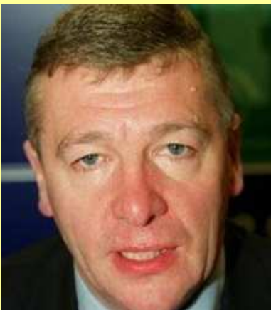
Above picture of Graham Stringer-Labour MP

The Manchester Blackley MP argued dyslexia, which affects six million people in the UK, should be "consigned to the dustbin of history" in an article for ManchesterConfidential.com .